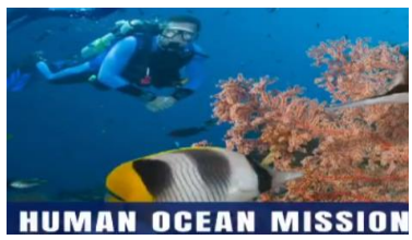
HUMAN OCEAN MISSION